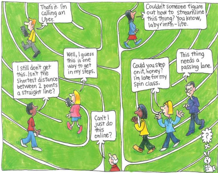
TYPE-A'S MEET THE LABYRINTH