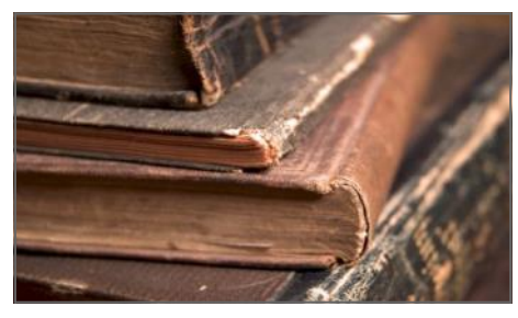
From the Parish Register

This class, facilitated by the Rector, meets in Room 302 (the Library) on the third floor of the Parish Building,