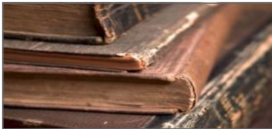
From the Parish Register