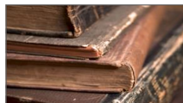
From the Parish Register

Remember: Gifts to St. Andrew's Foundation are a lovely way to remember a birthday, anniversary or any special occasion!