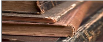
From the Parish Register