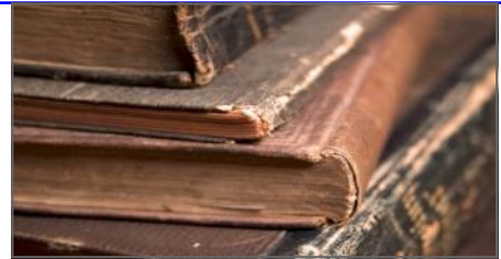
From the Parish Register

Proverbs 11:25 reads in part "...those who refresh others will themselves be refreshed." Thank you all for prayerfully considering how you can support this ministry!